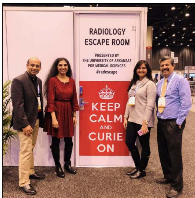
UAMS Radiology hosted the famous Radiology Escape Room once again at RSNA 2019, which was very well received!