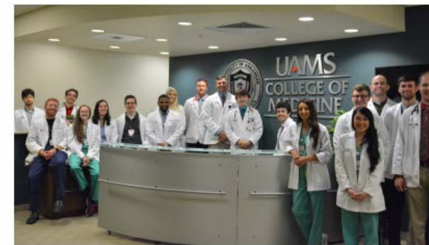
Photo taken prior to COVID-19

We are excited to announce the expansion of UAMS College of Medicine medical training on the Northwest Arkansas Campus where select medical students wishing to complete their entire MD in Fayetteville, Arkansas may have the opportunity to do so. There is also the option for students to complete their first two years of training in Little Rock and then to move to NWA to complete their M3 and M4 clinical years in Northwest Arkansas. For incoming medical students who know they wish to enter primary care fields, (e.g. pediatrics, family medicine or internal medicine), an innovative three year MD Primary Care Scholars training track is exclusively offered on the Northwest UAMS Campus. This program is highly competitive and requires a