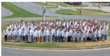
During Orientation Week, Freshmen in Little Rock gathered for a group photo on Hooper Drive. (Click on the photo for a larger image!)

Little Rock ceremony photography by Bryan Clifton. Northwest Arkansas photography by Daniel Moody.