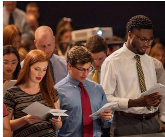
Students recite the Medical Student Oath in Robinson Center Performance Hall in Little Rock.