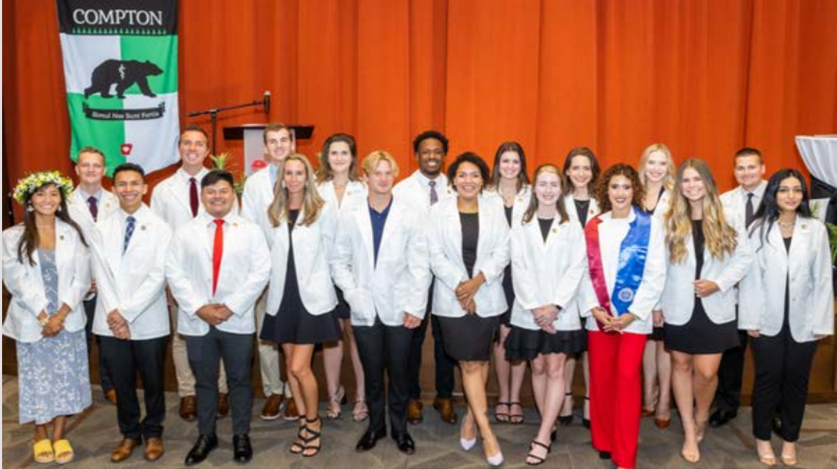
Freshmen at the UAMS Northwest Regional Campus celebrated with family and faculty at Butterfield Trail Village in Fayetteville. (Click on the photo for a larger image!)